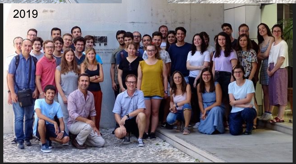
LIP Summer Internships -- since 2017